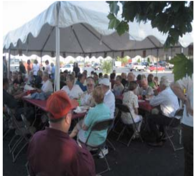
Group eating excellent BBQ Did everybody find your WANTED POSTER?