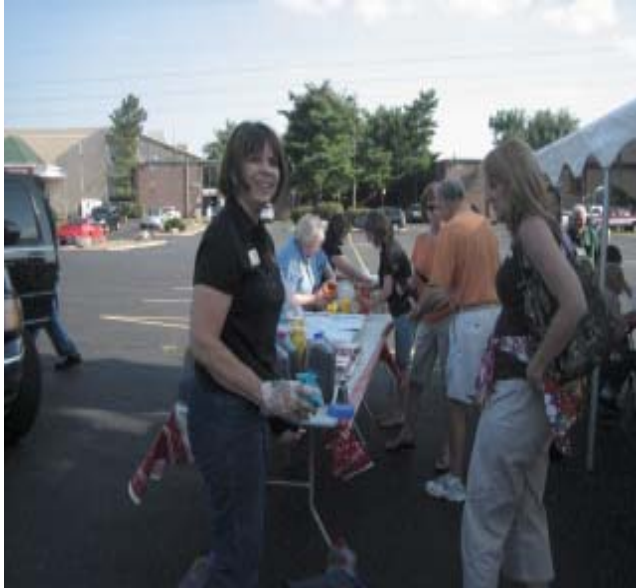
Summit ladies setting yet for the meal