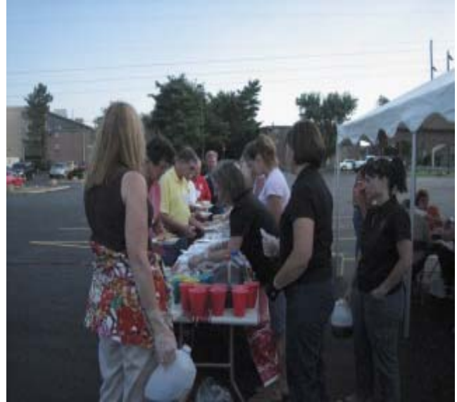
Are we about ready to eat?